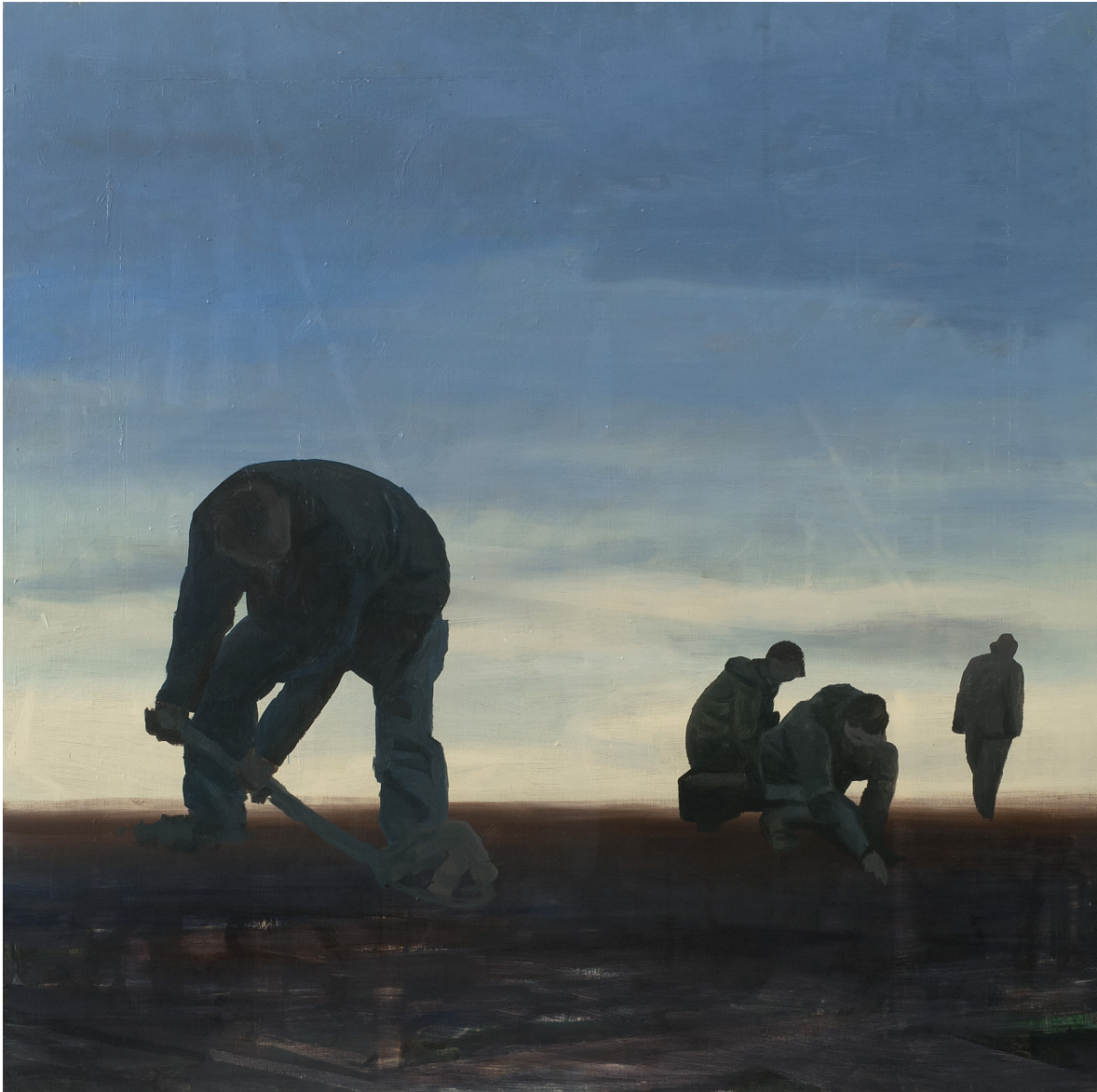
Arthur Aillaud, Sans titre , 2016, huile sur toile, 130 x 130 cm