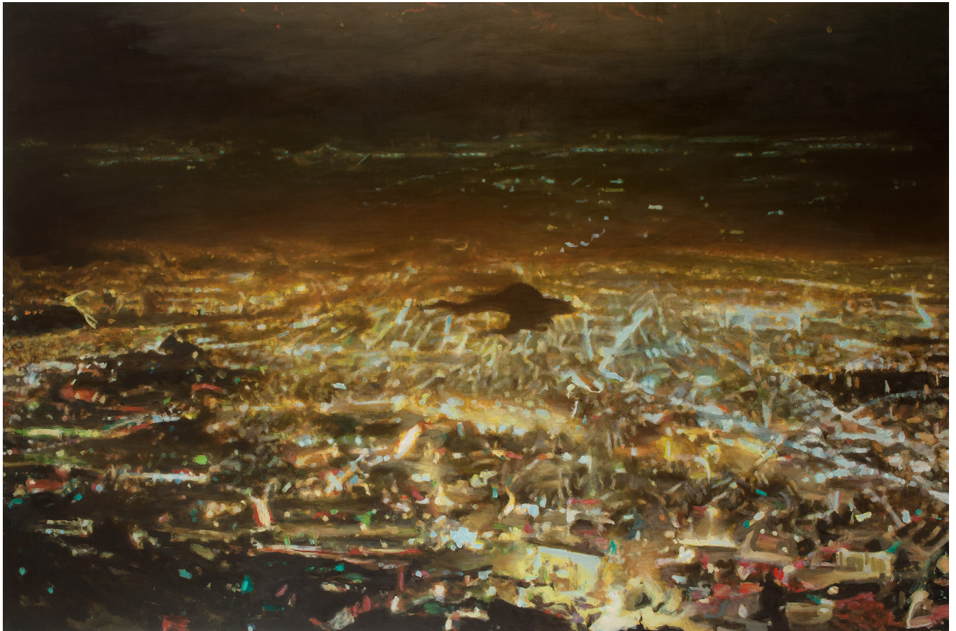
Arthur Aillaud, Sans titre , 2016, huile sur toile, 200 x 300 cm