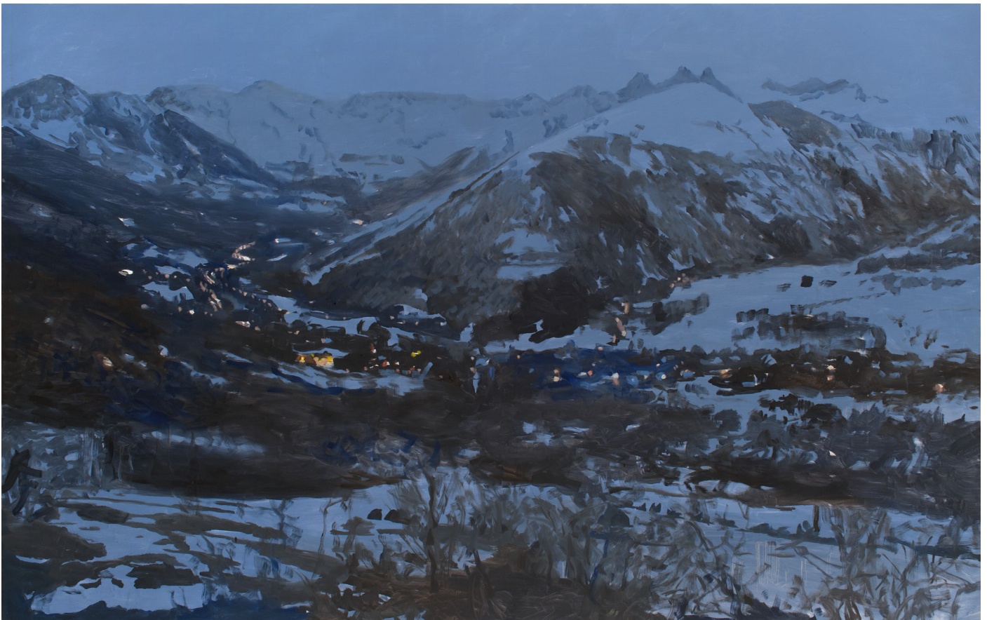
Arthur Aillaud, Sans titre , 2016, huile sur toile, 190 x 300 cm

The whole body of work is bathed into an indefinable light that gives it its singular tone : is it dusk or dawn? Arthur Aillaud feeds this ambiguity between night and day, planarity and perspective, seductive figuration and rigorous geometric plane, keeping the different interpretations open, thus making it impossible to reduce his canvases, or his art to an unique vision.