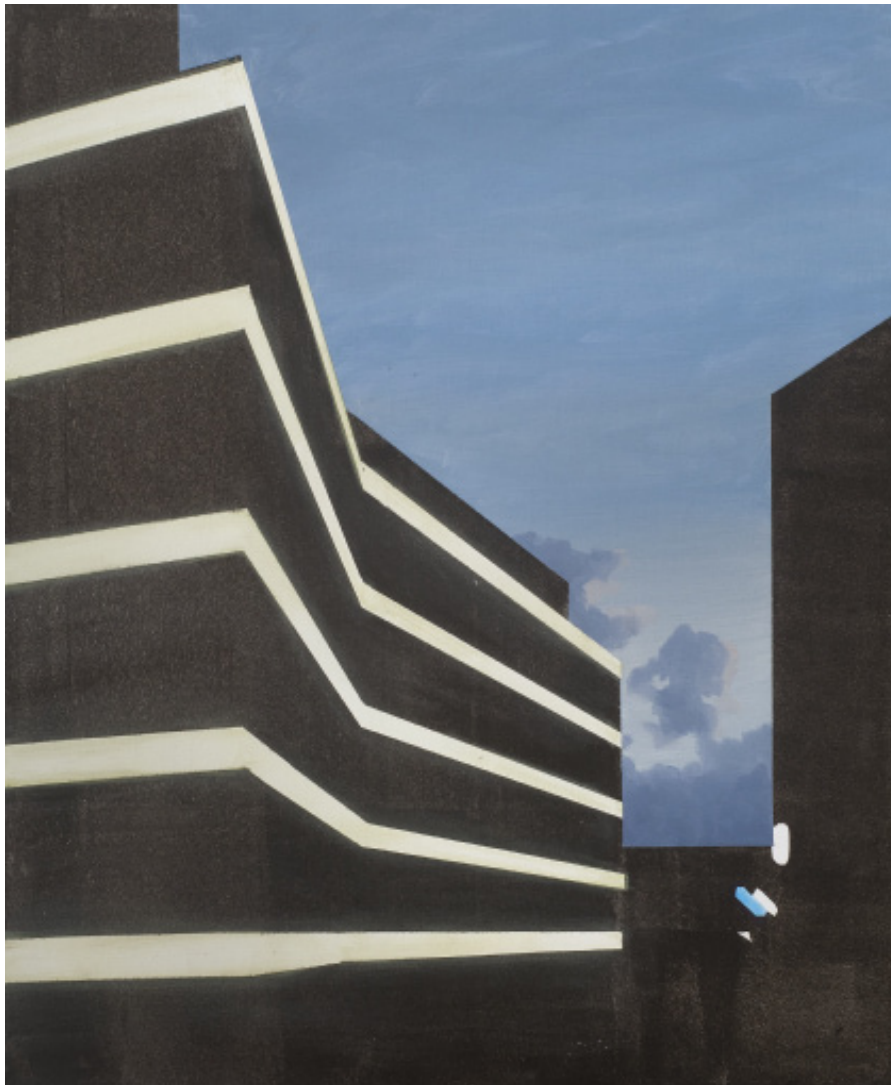
Arthur Aillaud, Sans titre , 2016, huile sur toile, 73 x 60 cm

Vernissage Thursday, September 22 from 6 to 9pm