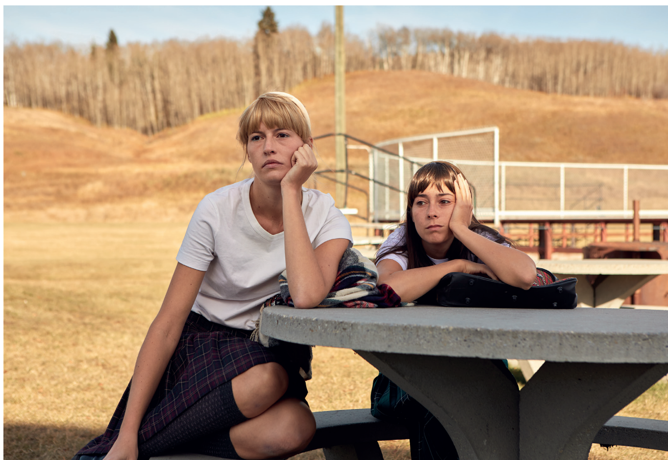
"Playground", Beyond the shadows, 2018, Semi-matt inkjet print, H 60 x L 90 cm, tirage de 5 ex + 2EA

Brussels Gallery Weekend du 3 au 7 septembre 2020