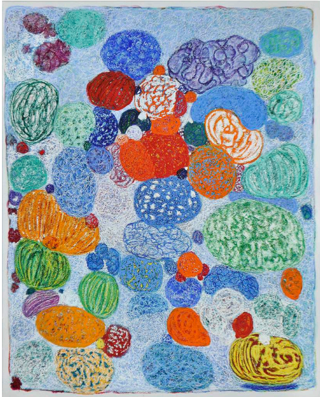
Jeff Kowatch, Que Seurat Seurat , 2019, Oil Bar on Dibond, 235x190cm