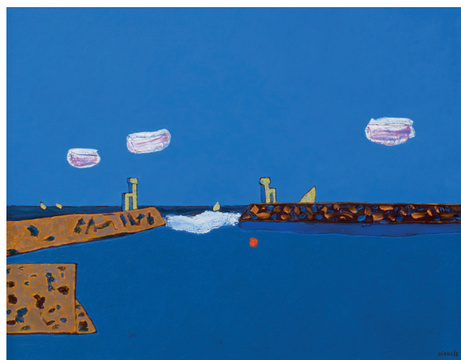
Vincent Bioulès, Le Port de Carnon 2022, huile sur toile, 81x100cm