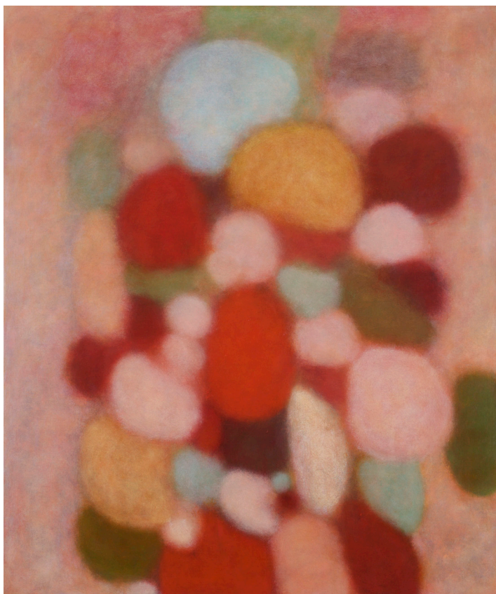
Jeff Kowatch, Take Five , Oil on linen 120 x 100 cm, 2024