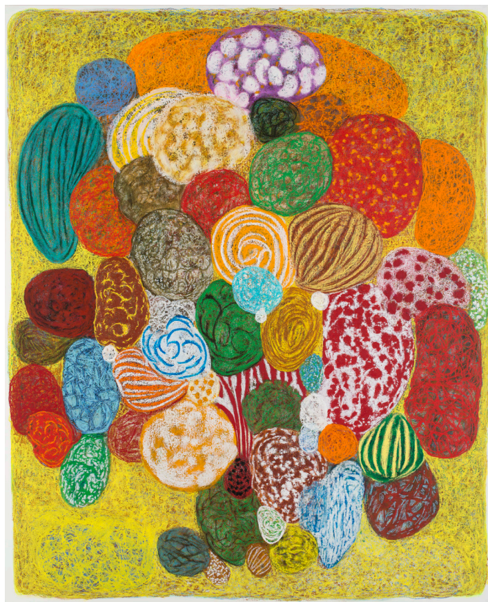
Jeff Kowatch, Le Fauve , oil bar on dibond, H 210 x L 170 cm, 2023

These are two very elaborate and slow techniques, requiring six to eight months' work for the oil sticks, and two to three years for the canvases, on which he superimposes up to a hundred successive layers. It is this layering that gives them exceptional texture, color and depth over time. Jeff Kowatch was deeply inspired by Monet and the garden at Giverny. His painting is also rooted in a very American abstraction, but is built on the techniques of 17th-century European painting, and often draws on the subjects of still lifes and floral compositions from the Golden Age.