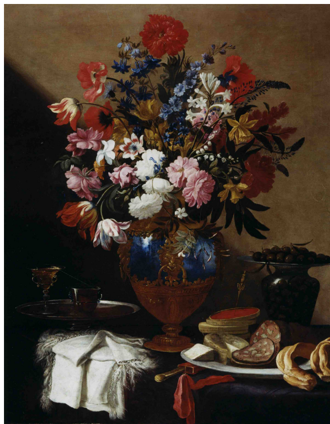
Pier Francesco Cittadini, Vase of Flowers with Pale of Olives, Salami and Cheese, Preserves, a Chalice and a white fringed Cloth , Oil on canvas, 125 x 100 cm, circa 1660