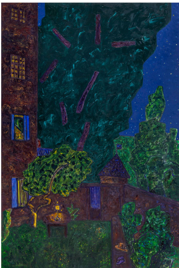
Vincent Bioulès, Nocturne à Laubert II , Oil on canvas, 195 x 130 cm, 2023

Virginie Luel v.luel@galerielaforestdivonne.com - +32 478 49 95 97