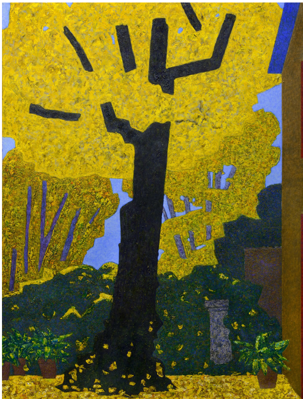
Vincent Bioulès, L'Automne dans mon jardin , Oil on canvas, 200 x 150 cm, 2016

Extract from the press release Chantal Colleu-Dumond Director of the Domaine and curator of the Art Season