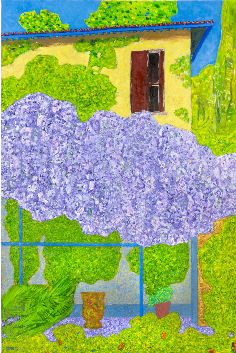
Vincent Bioulès, La Glycline , Oil on canvas, 195 x 130 cm, 2023 © Pierre Schwartz