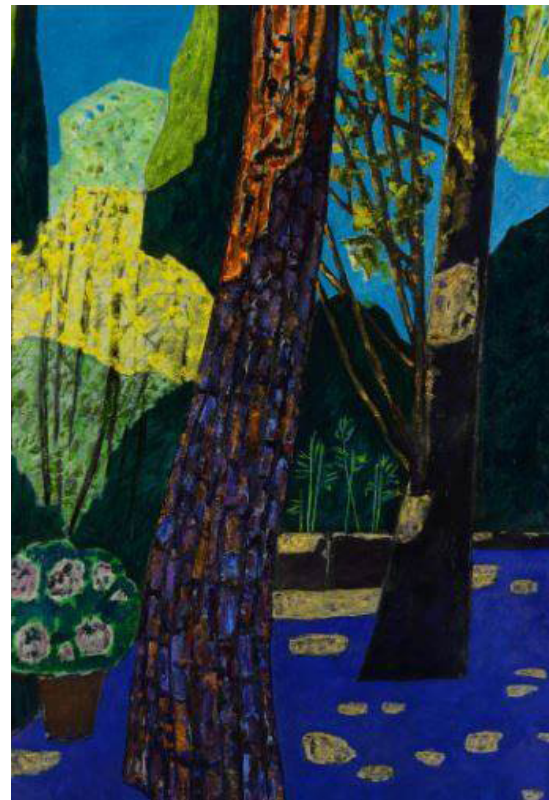
Vincent Bioulès, Le Soir dans le jardin , Oil on canvas, 195 x 130 cm, 2015

Domaine de Chaumont-Sur-Loire 4115 Chaumont-Sur-Loire Tel : 02 54 20 99 22 / Fax : 02 54 20 99 24