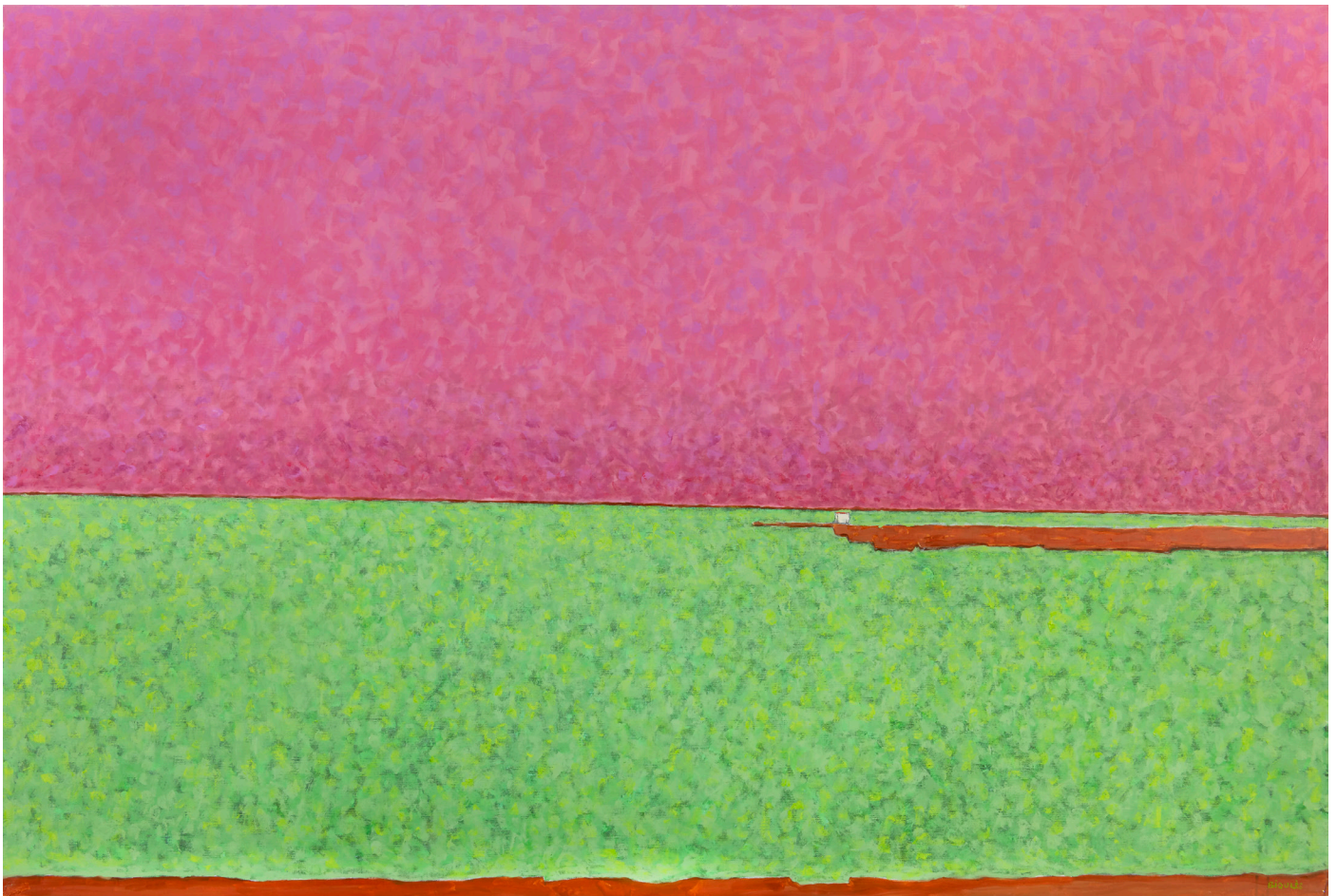
Vincent Bioulès, L'Étang de l'Or ou le grand soir , Oil on canvas, 130 x 195 cm, 2023