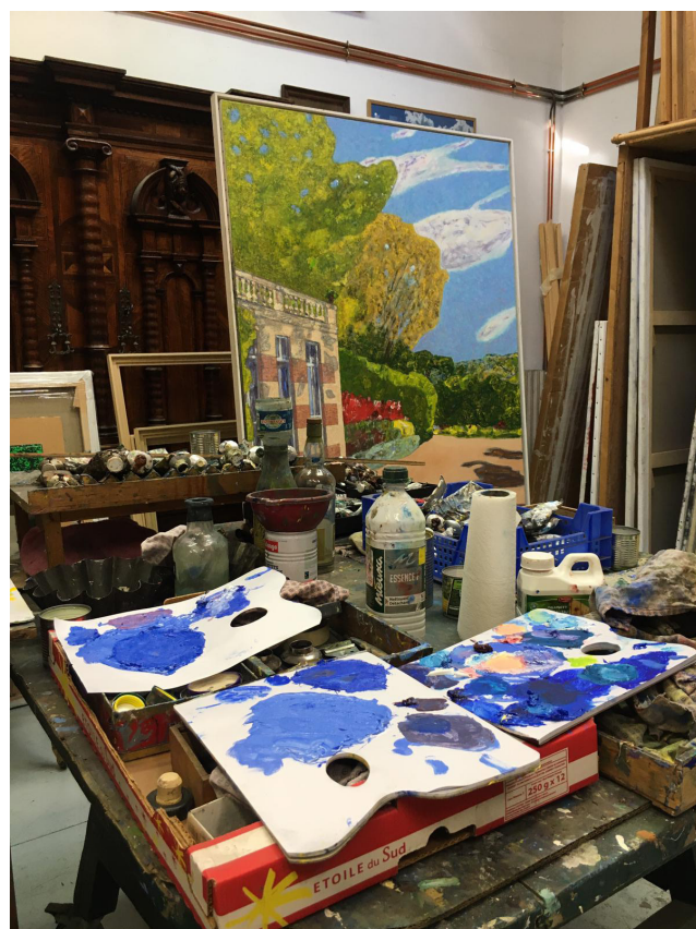
Vincent Bioulès' studio

Centre Georges Pompidou, Paris Museum of Fine Arts, Caen CAPC, Bordeaux Musée Cantini, Marseille Musée Fabre, Montpellier Museum of Modern Art, Céret Museum of Modern & Contemporary Art, Saint-Etienne Musée de Toulon MAMAC, Nice Musée Picasso, Antibes Museum of Modern & Contemporary Art, Strasbourg Museum of Fine Art, Strasbourg