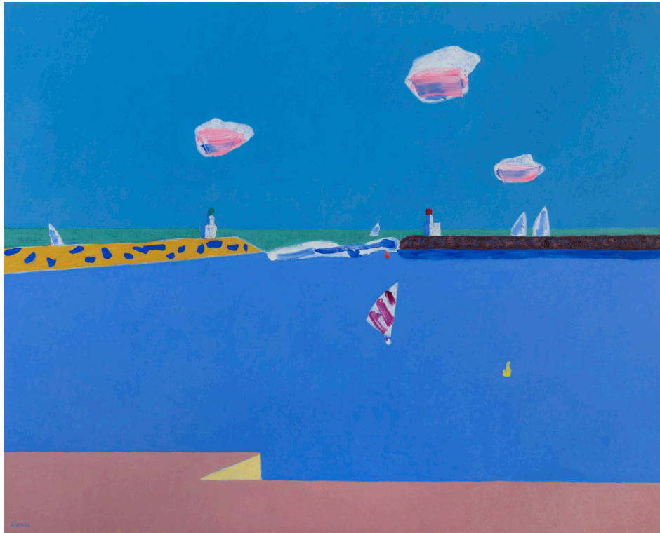
Vincent Bioulès, Le Port de Carnon , Oil on canvas, 130 x 162 cm, 2023

The geography of a life, which Bioulès revisits with sensual, lively painting, as if the artist wanted to console us for the troubles of the world by inviting the visitor to see its beauty in spite of everything. The exhibition will undoubtedly inspire energy and wonder in those who see it, and reenergize them with this lesson in painting, celebrating humanity's dream harmony with nature.