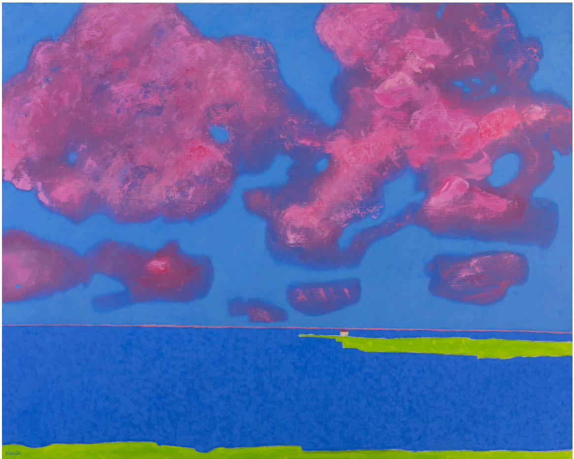
Vincent Bioulès, 19h45.0723 II , Oil on canvas, 130 x 162 cm, 2023